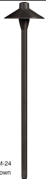
CL-649B-GM-24 24" Stem shown